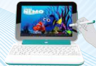
Smart E-Satchel S-02

Today's students live online completing homework assignments, doing research, and socializing with classmates. All the advantages of digital life also come with increasing security risks. McAfee AntiVirus Plus enforces safe and secure computing practices by proactively protecting devices from exposure to malware.