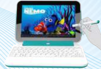
Smart E-Satchel S-02