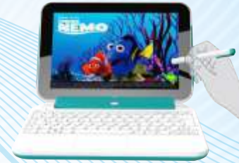
Smart E-Satchel S-02